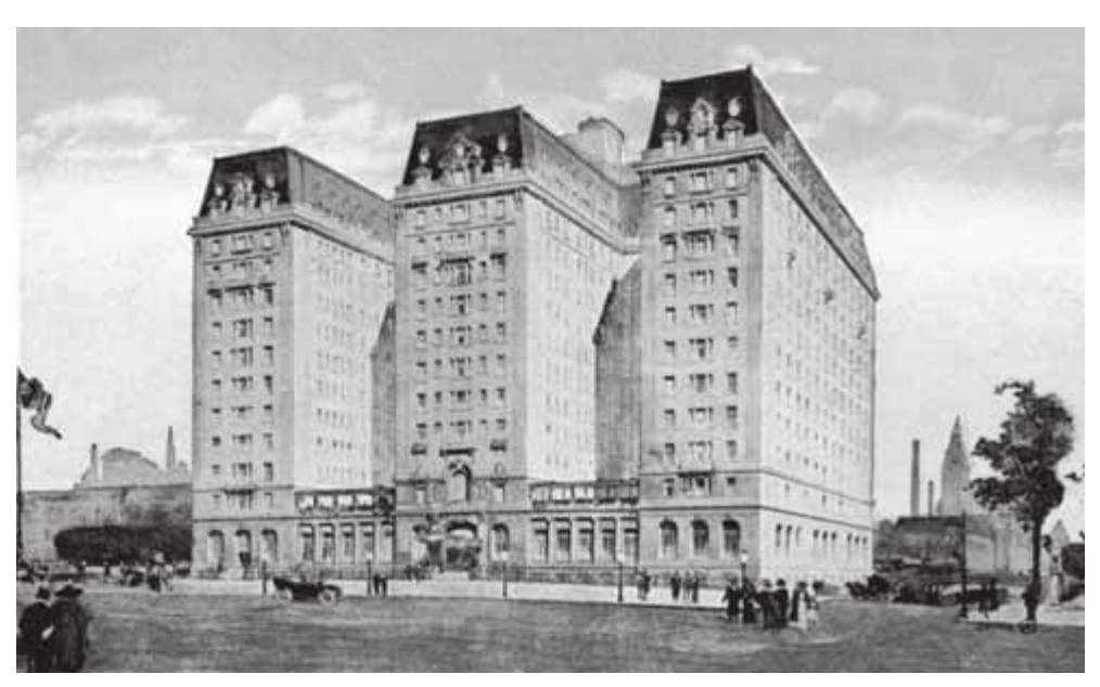
Postcard view of the Palliser Hotel, [ca. 1920]. Courtesy Glenbow Archives, PA-3689-100