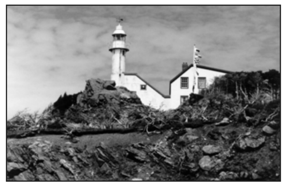
Photo 1 Rocky Harbour Lighthouse Capt. Harry Stone Collection, Maritime History Archive, PF-055.2-H07