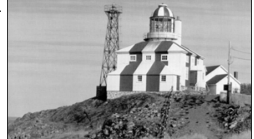
Photo 4: Cape Bonavista Lighthouse

Business meeting of the ACA, including presentation of reports and audited statements, election of two directors, approval of budget and consideration of any Bylaw amendments.