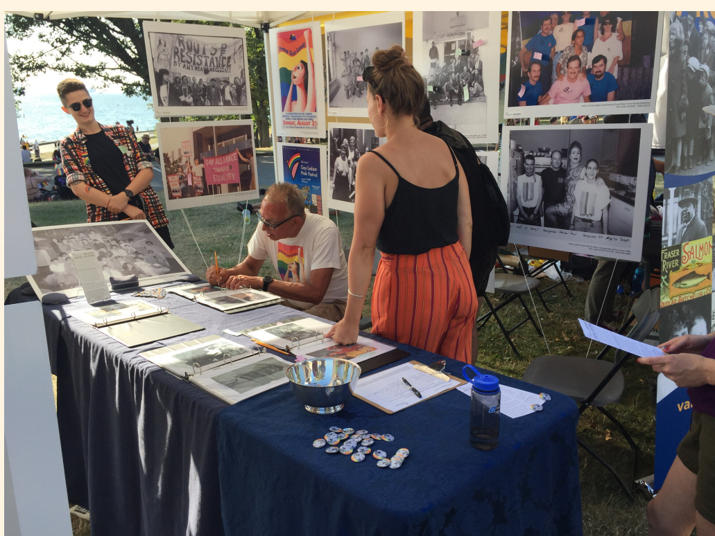
CVA at the 2019 Pride Festival

CVA partnered with the Vancouver Pride Society and the SUM Gallery/Queer Arts Festival (QAF) to table at the following events in Vancouver: East Side Pride, QAF Queer Songbook Orchestra, City's Pride Proclamation and the 2019 Pride Festival. The Photo ID Workshop was co-hosted with the SUM Gallery/QAF.