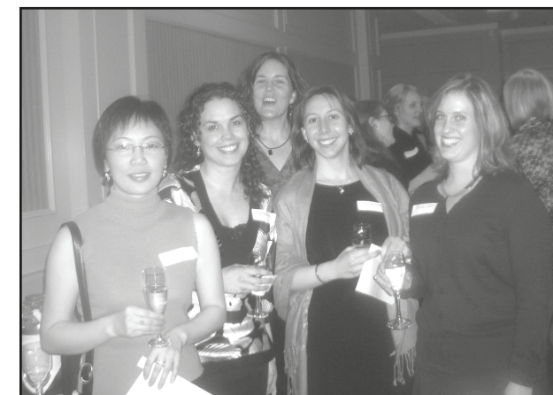
Current and graduating students 2007