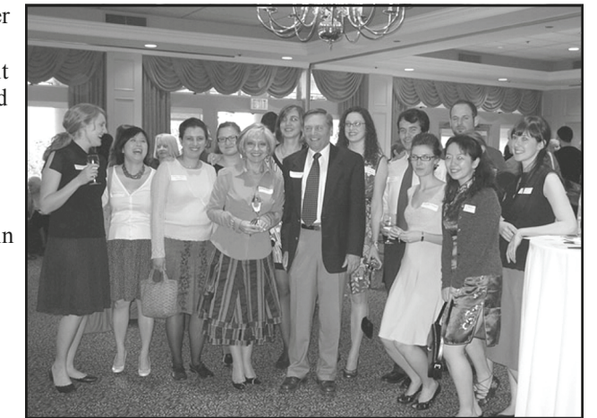
Part of the 25th class 2006-2008