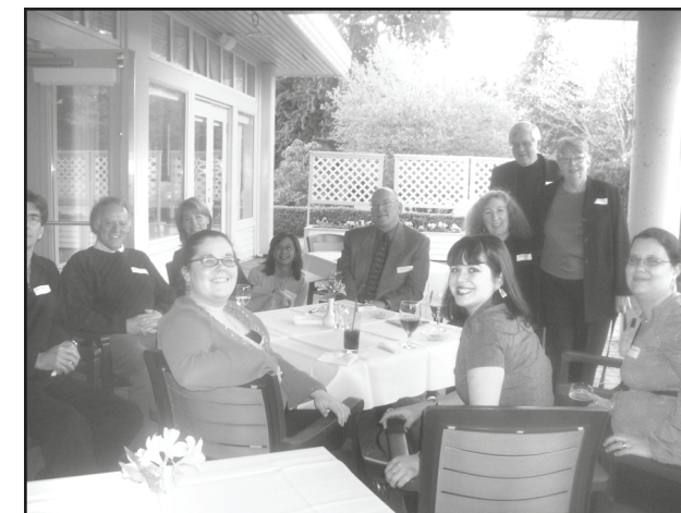
Some MAS graduates