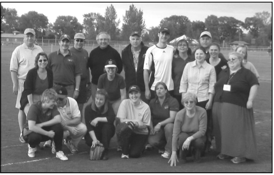
ACA delegates are reminded that they should remember to bring a comfortable pair of shoes for the traditional ACA ball game. The ball game will be held in the beautiful Bannerman Park in St. John's.